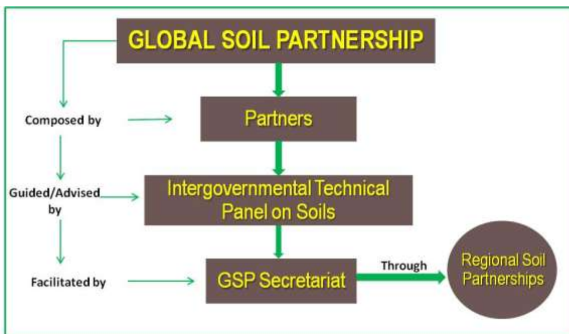
Figure 1: Governance of the Global Soil Partnership